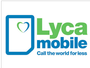
MVNO expands into personal finance market